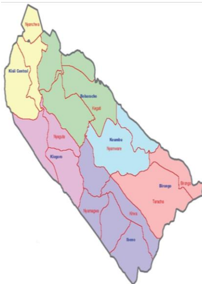
Figure 2: Kisii Sub-County Regions in Kisii County where the research was done